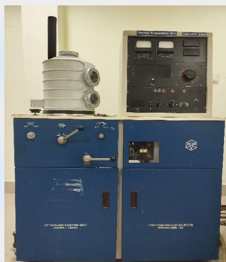
Thermal Vapor Deposition